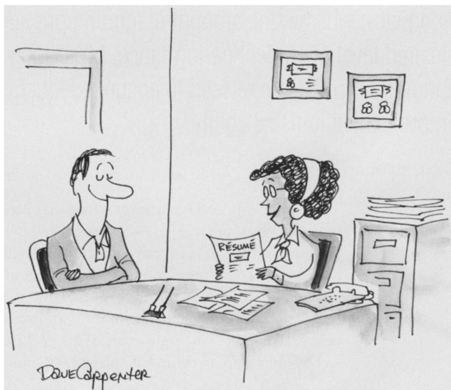
“Degree in psychology and a former referee. I think you’re qualified to be a school bus driver.”