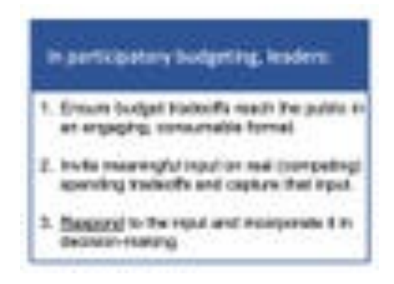
3 steps of participatory budgeting EDUNOMICS LAB

This isn't just some feel-good theory. There are clear upsides, in the form of increased community trust in leadership and democratic institutions.